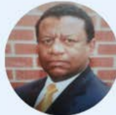
Frank Calvin Mayor of Spencer