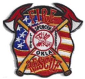
Spencer Fire Department (SFD)